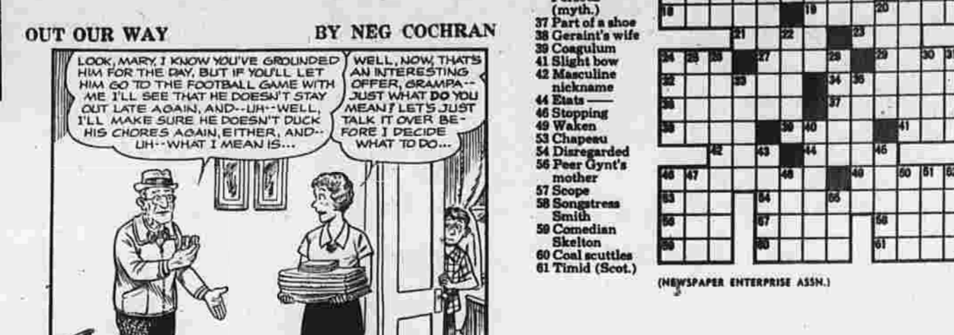
OUT OUR WAY BY NEG COCHRAN