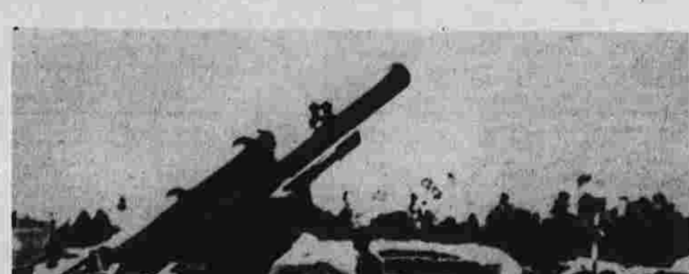
South Viet artillerymen set charges on 105mm howitzer shells at Fire Base Pace near the Cambodian border. Helicopters took about 150 Americans out of the base, leaving it solely in the hands of the South Vietnamese.

HARTFORD (AP) — Most of the bus riders in the state face the possibility of having to find alternate means of transportation during the drivers and mechanics of the largest carrier of municipal bus traffic in Connecticut voted to authorize a strike.