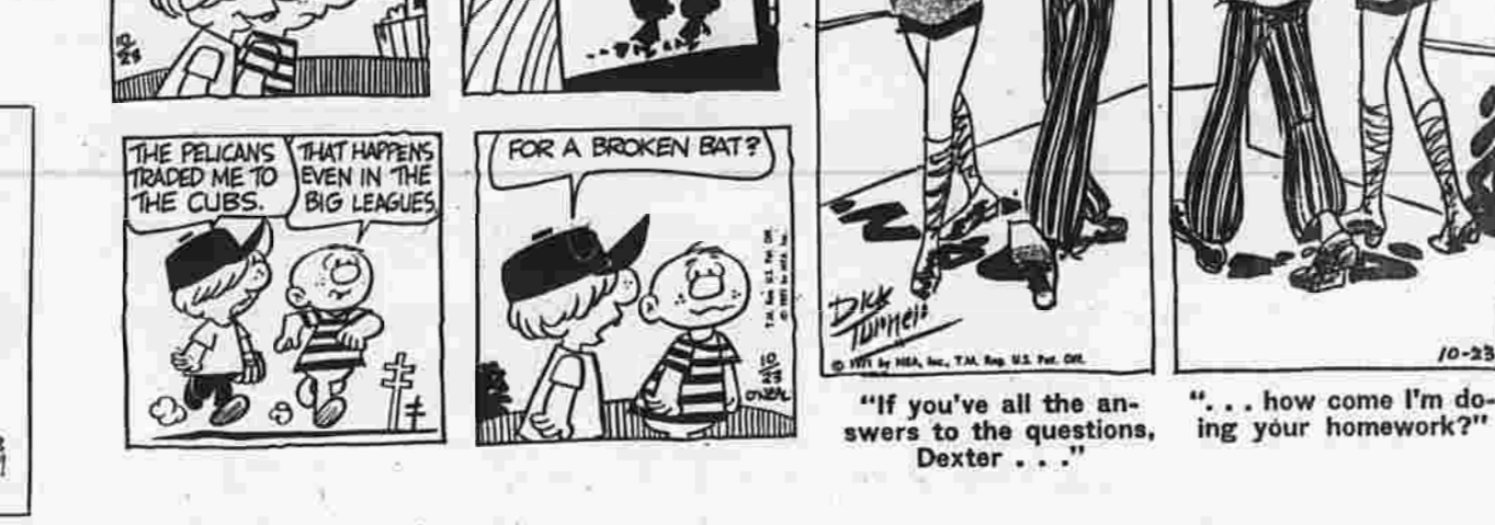
SHORT RIBS BY FRANK O'NEAL